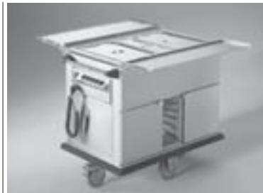
Gastronorm containers as accessories

Hinged lid 1/3, 2/3 divided lengthwise, with raised edge, can be locked into place as an extra work surface.