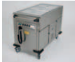
Gastronorm containers as accessories

2 fixed casters, 2 swivel casters with double brake 1 swivel caster each on face side, centre, with double brake, 2 fixed casters in middle of trolley, connected via a live axle