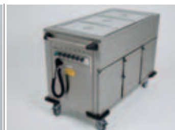
Gastronorm containers as accessories