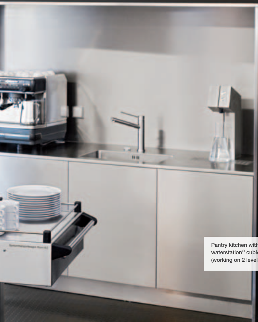
Pantry kitchen with the waterstation® cubic sink (working on 2 levels)