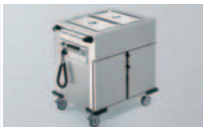
Gastronorm containers as accessories

2 fixed casters in middle of trolley, connected via a live axle