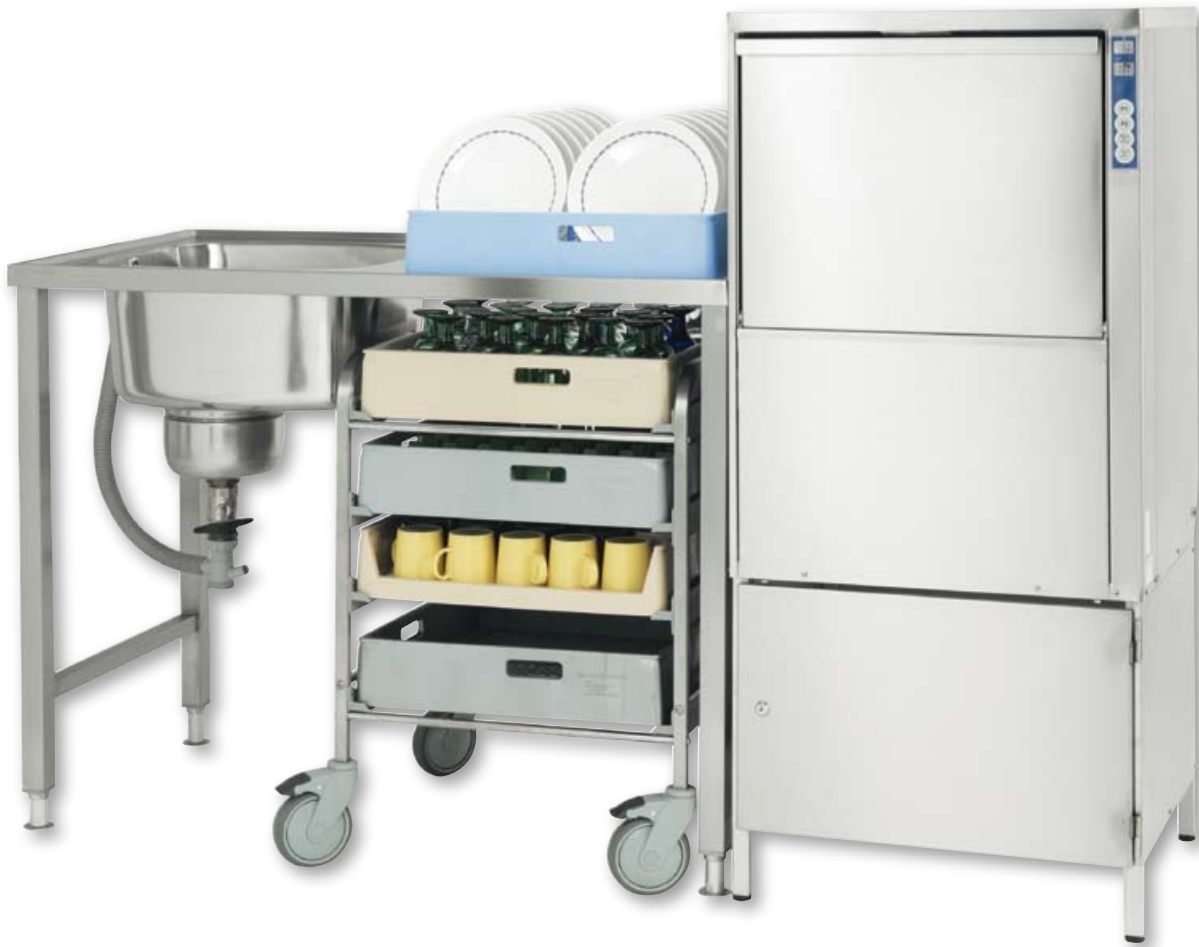
The WD-4 placed on a bottom frame with a lockable cabinet (accessories). The trolley and sink are not part of the range.