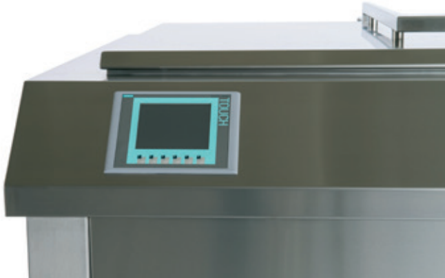
Touch screen display to control cooking and cooling