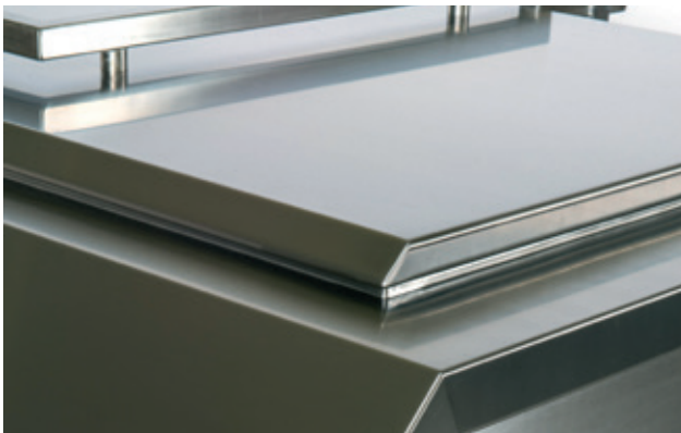
Lid is tight and lightened