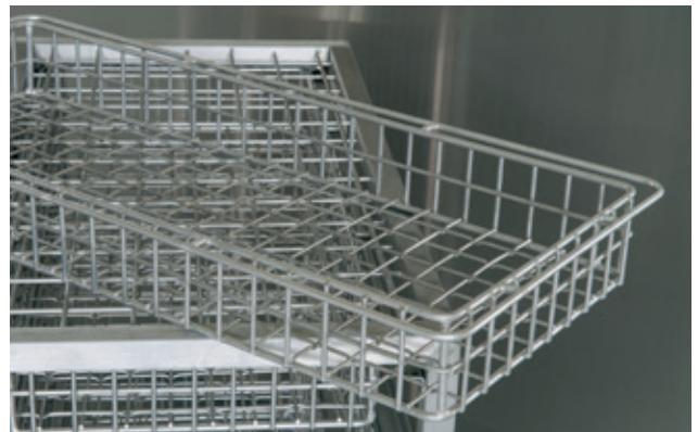
Baskets and, racks are included in the delivery