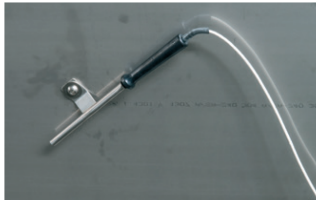
Core temperature probe to precise temperature control